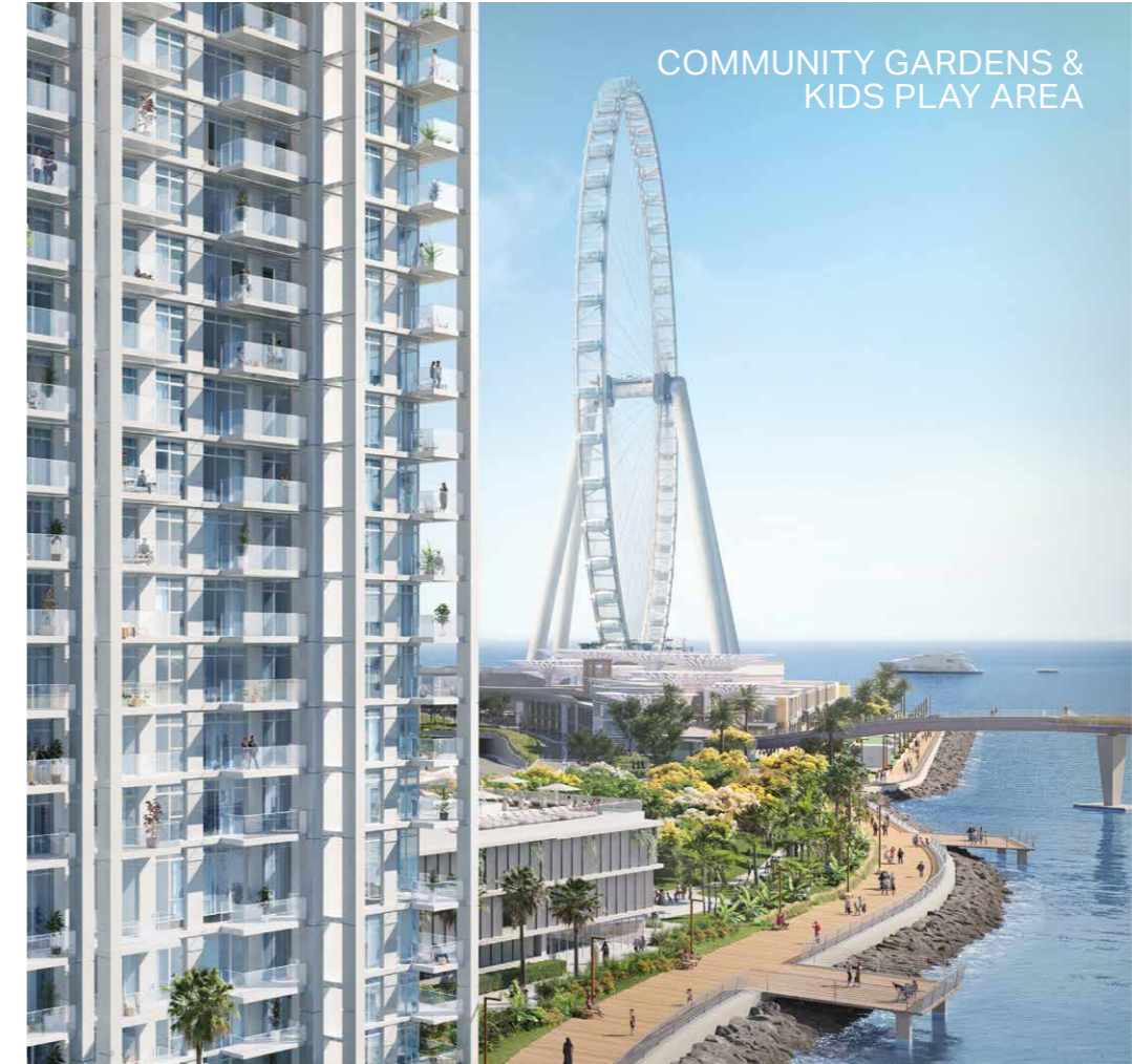
COMMUNITY GARDENS & KIDS PLAY AREA