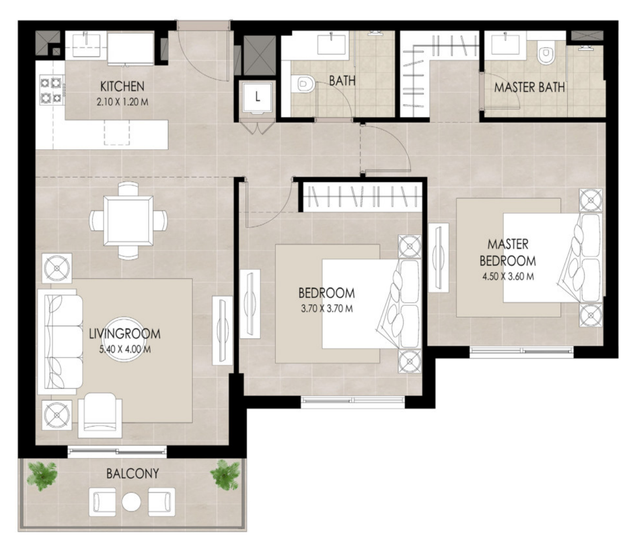
*Balcony sizes vary