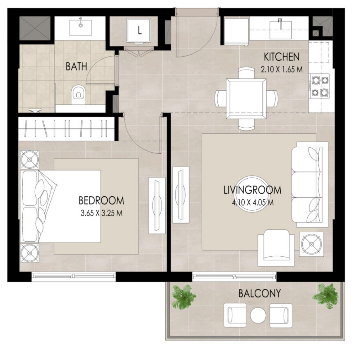
*Balcony sizes vary