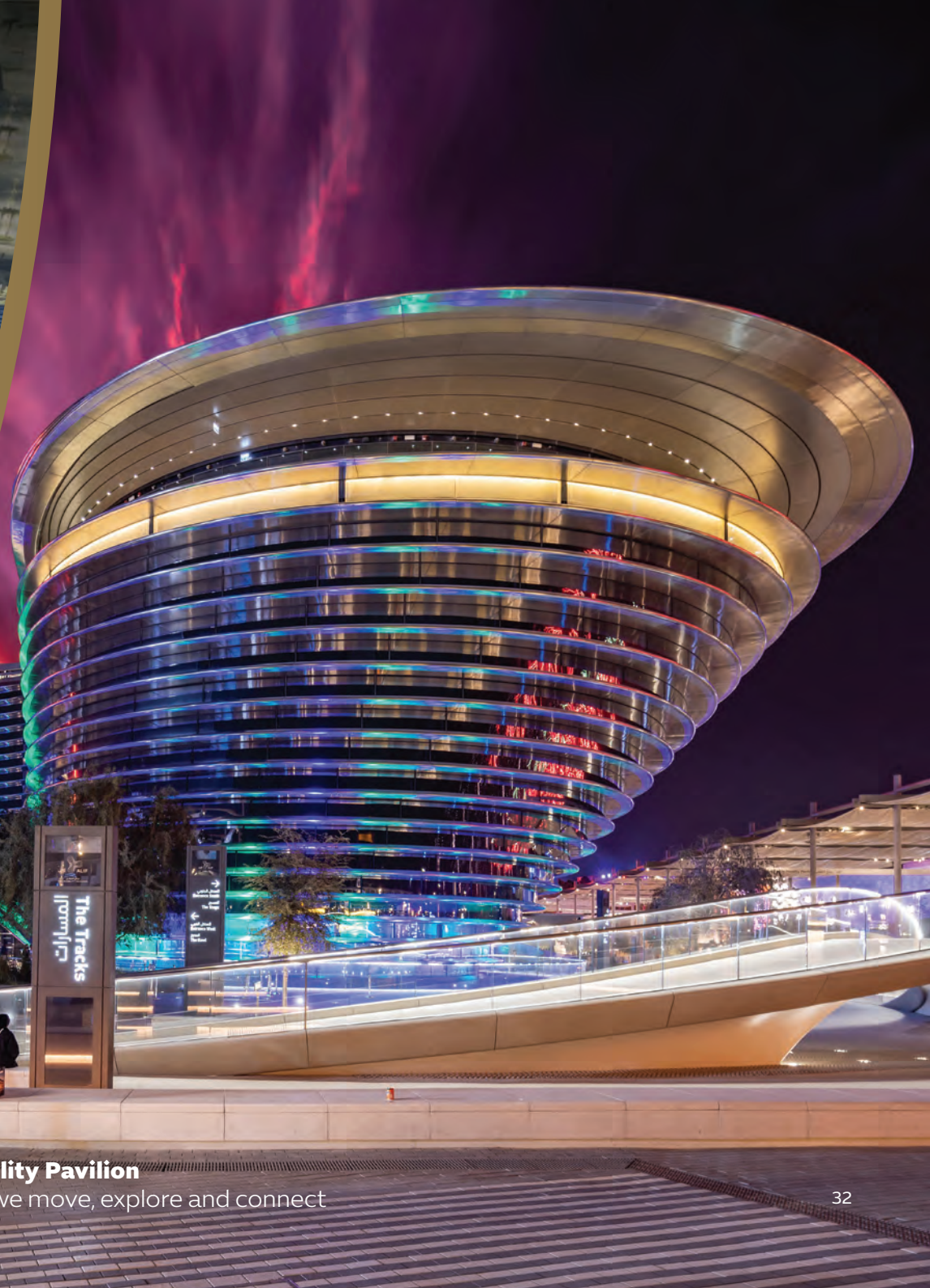
Alif – The Mobility Pavilion Exploring how we move, explore and connect