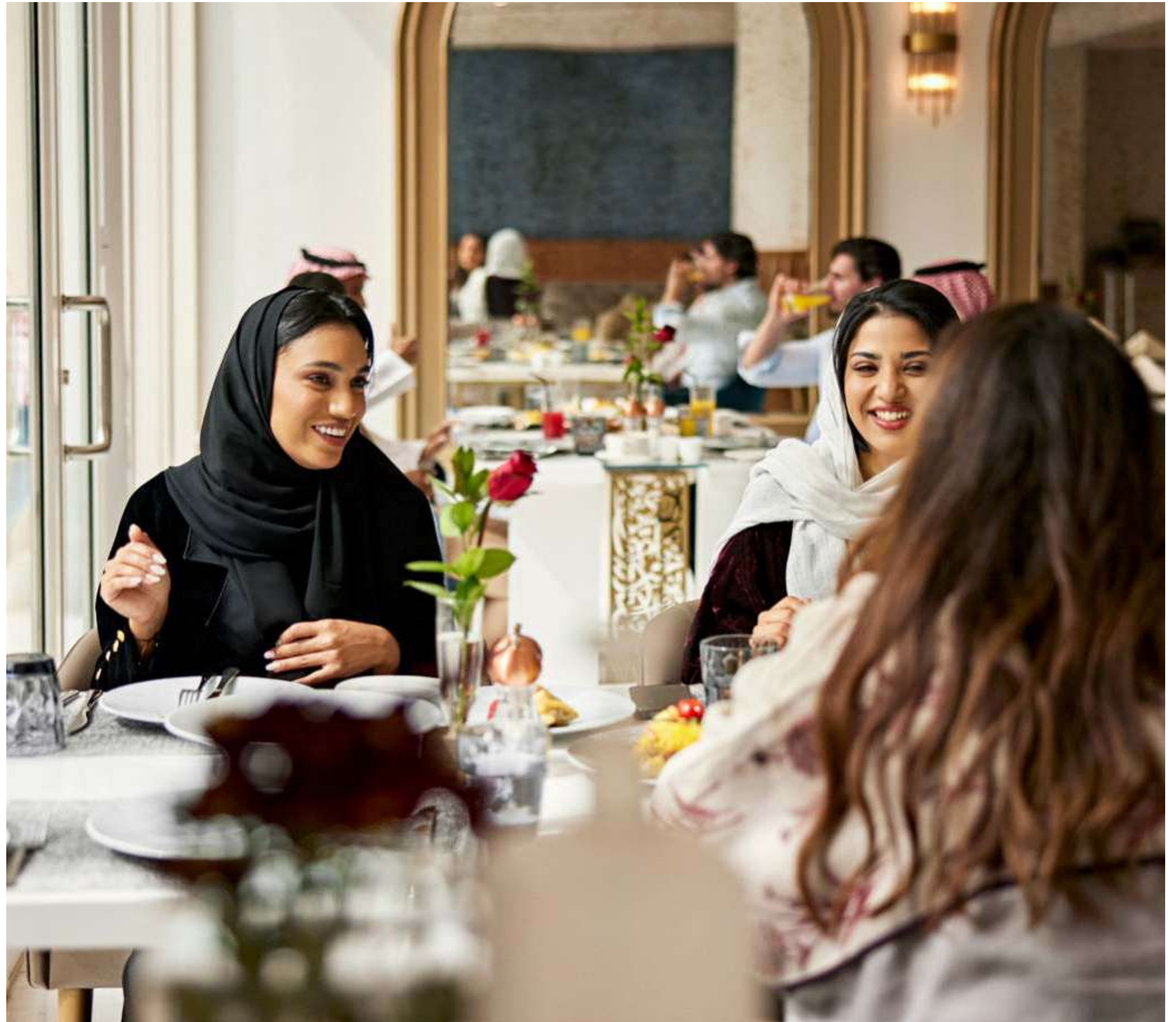
Retail & Dining