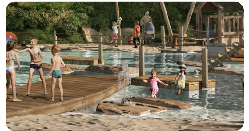
Swimming pools, splash pads and kids' play areas