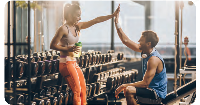
Gyms, outdoor wellness and fitness areas