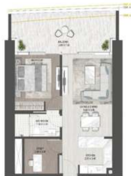
1-BEDROOM WITH STUDY