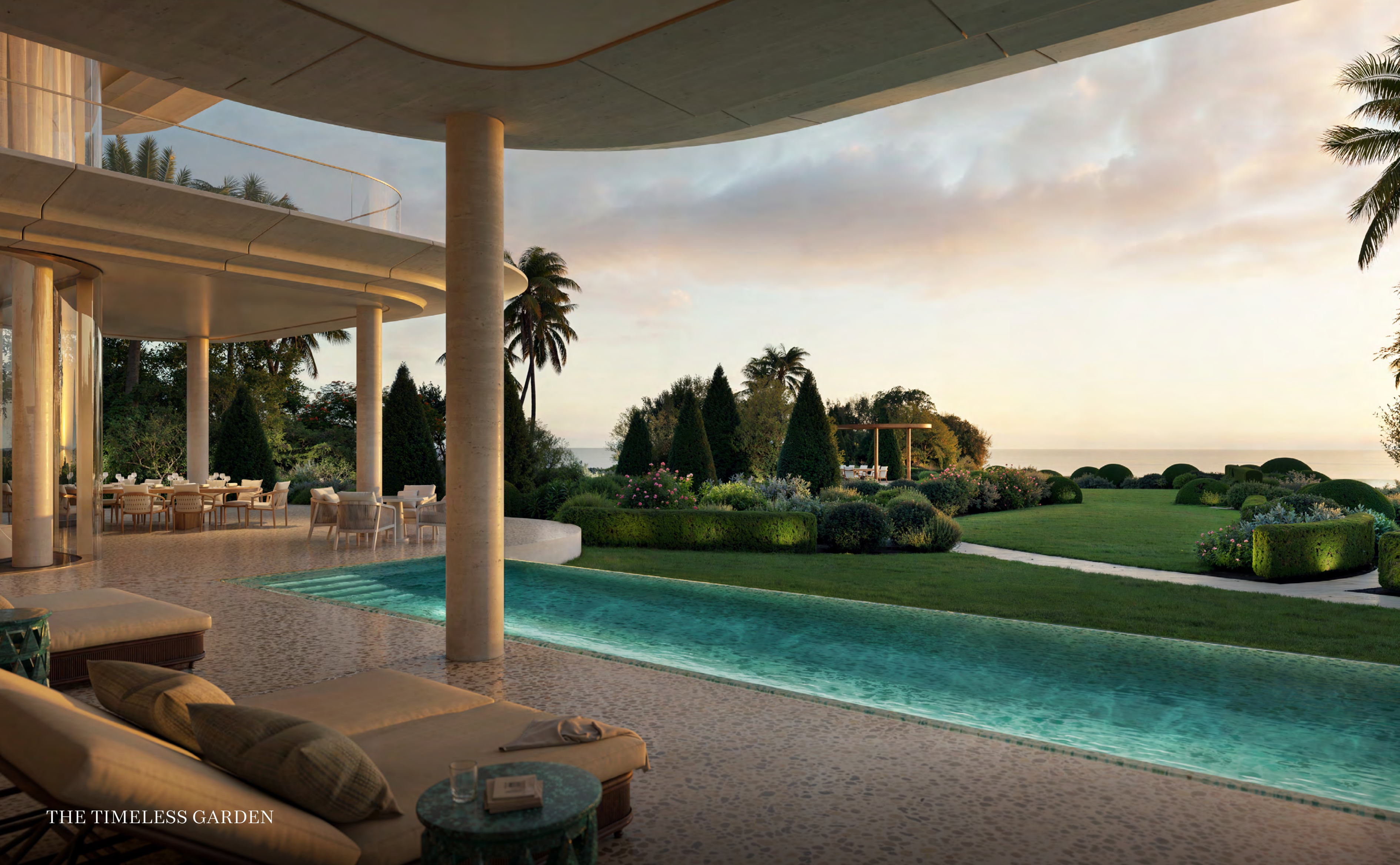
THE TIMELESS GARDEN