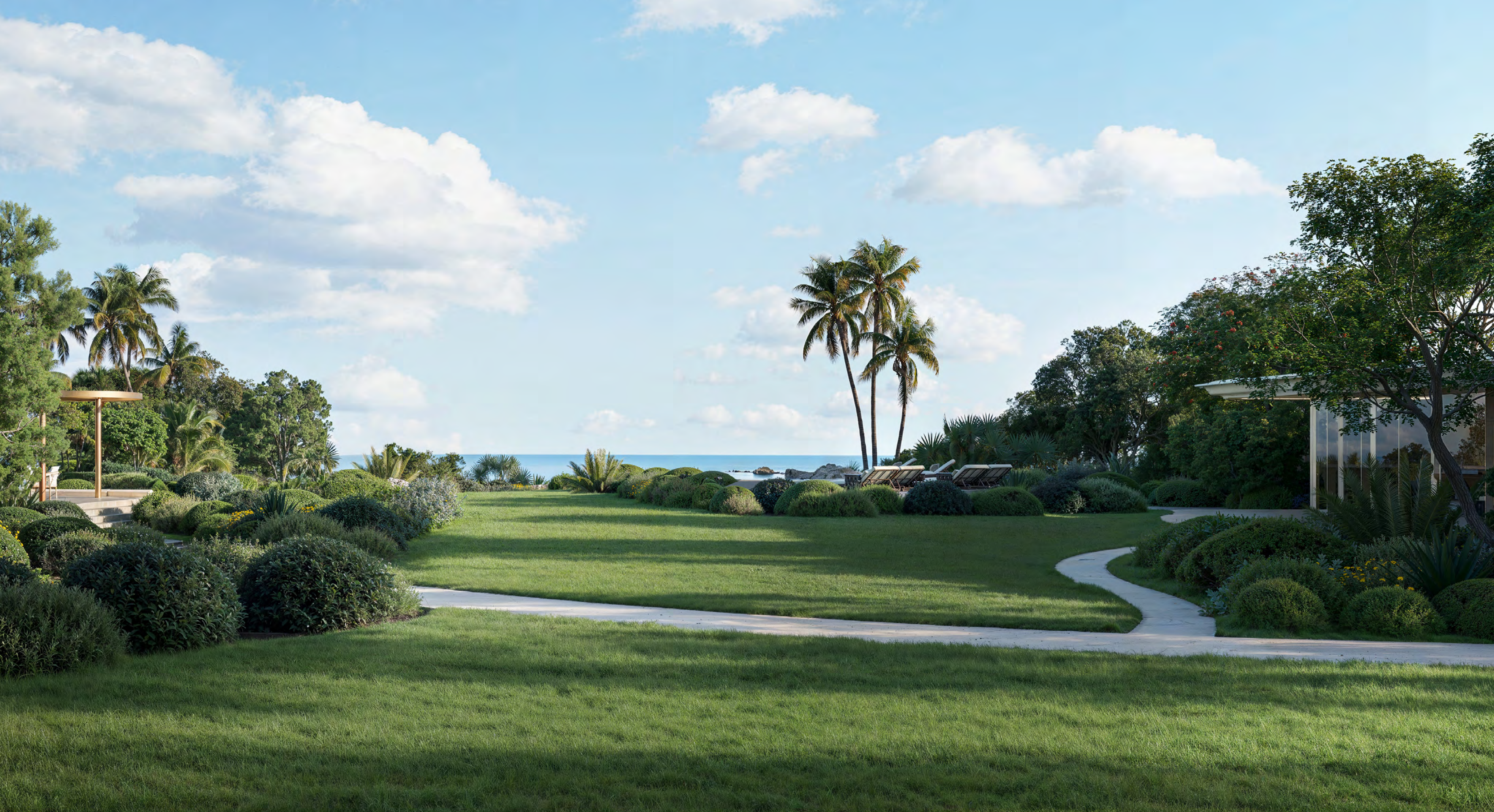
THE NATURE GARDEN