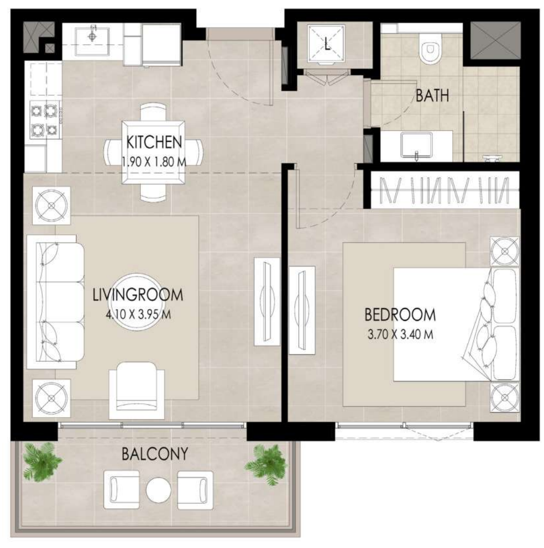
*Balcony sizes vary

SUITE AREA 51.96 Sq.m / 559.29 Sq.ft BALCONY AREA 7.26 Sq.m / 78.15 Sq.ft TOTAL BUILT-UP AREA 59.22 Sq.m / 637.44 Sq.ft