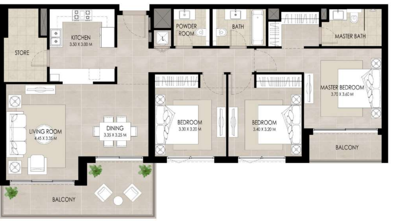
*Balcony sizes vary

SUITE AREA 120.51 Sq.m / 1297.16 Sq.ft BALCONY AREA 20.66 Sq.m / 222.38 Sq.ft TOTAL BUILT-UP AREA 141.17 Sq.m / 1519.54 Sq.ft