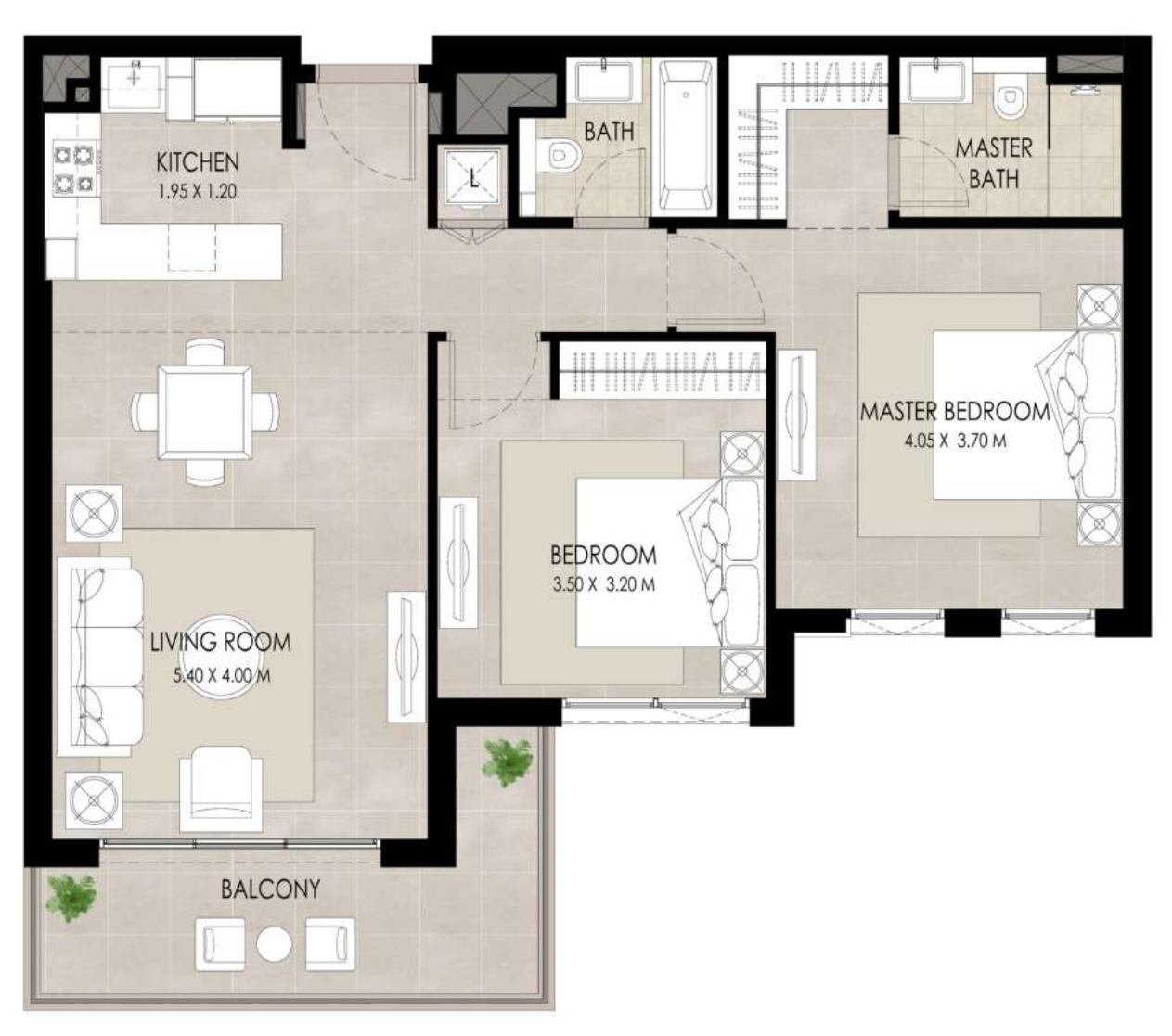
*Balcony sizes vary