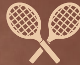
Squash & Tennis Court