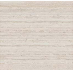
Travertino Pearl Porcelain