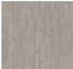
Parquet Grey Ashwood