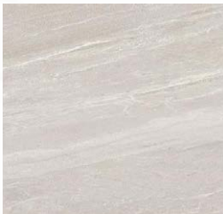
Faience Museum Mainstone Cloud Mat