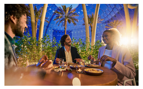
Five minutes from Al Wasl Plaza with its outdoor performances and immersive projections