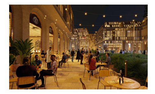
Bordering Expo Business offering prime connections to high-end professional opportunities as well as extensive dining and retail options