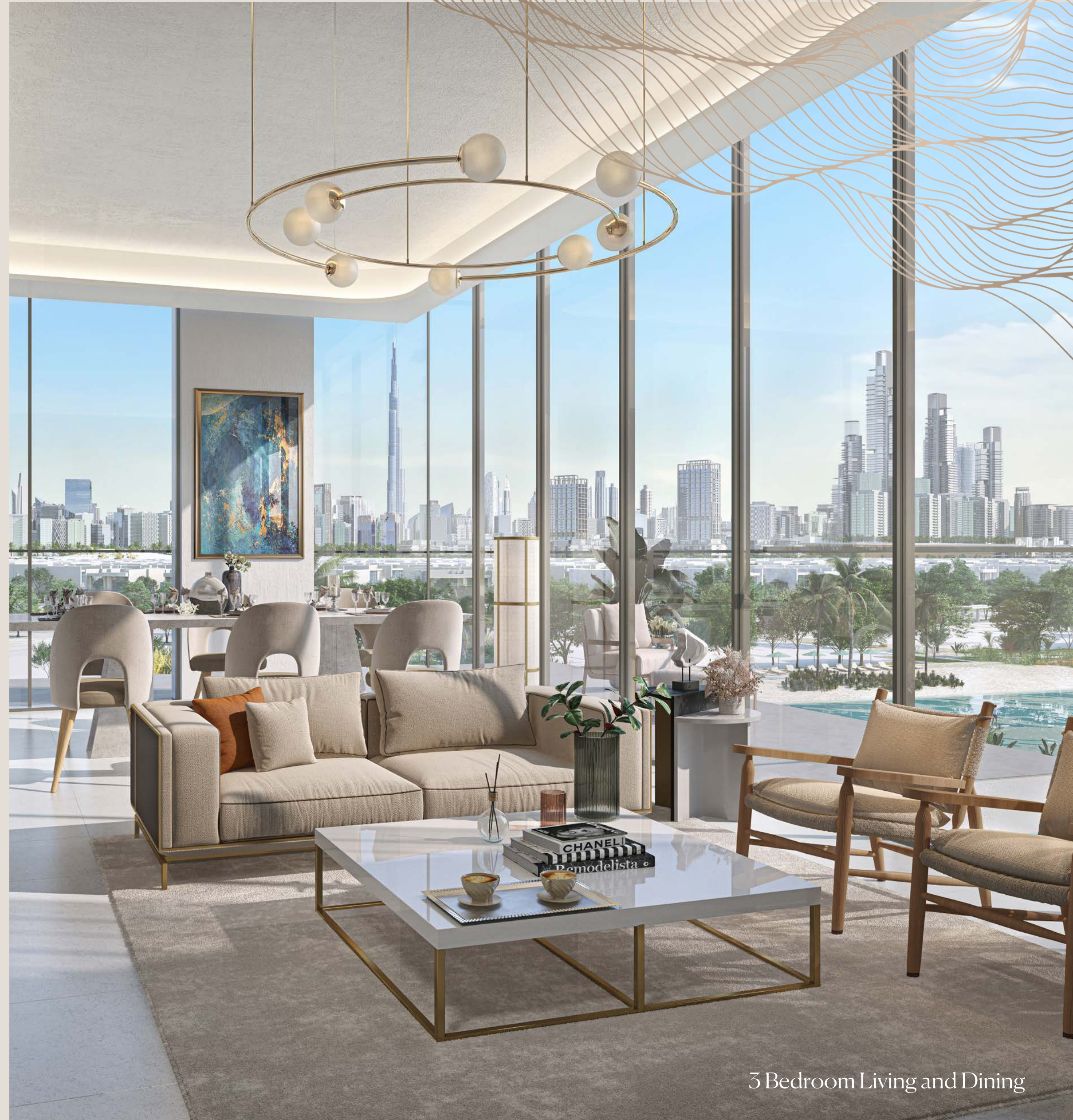
3 Bedroom Living and Dining