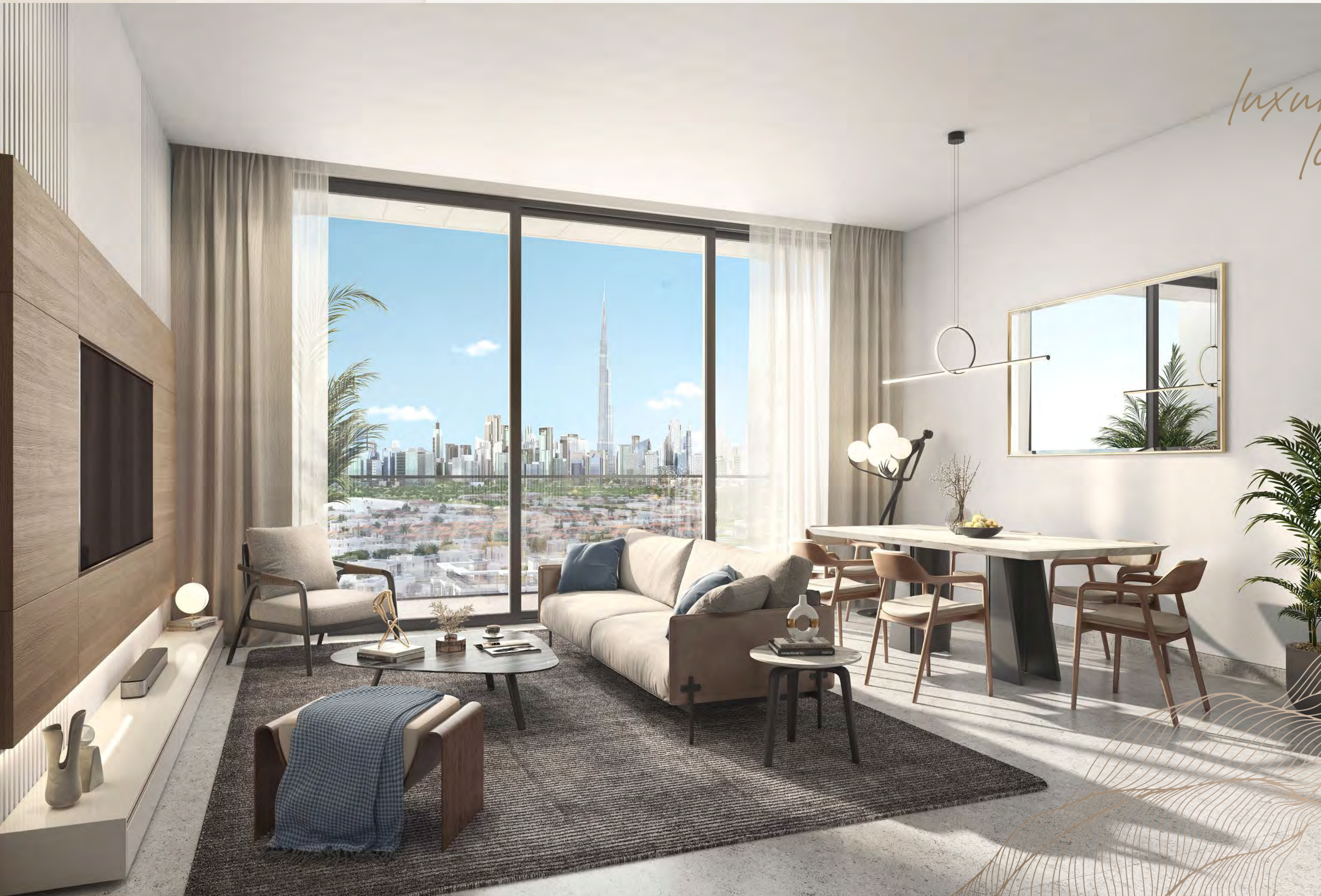
2 Bedroom Living and Dining