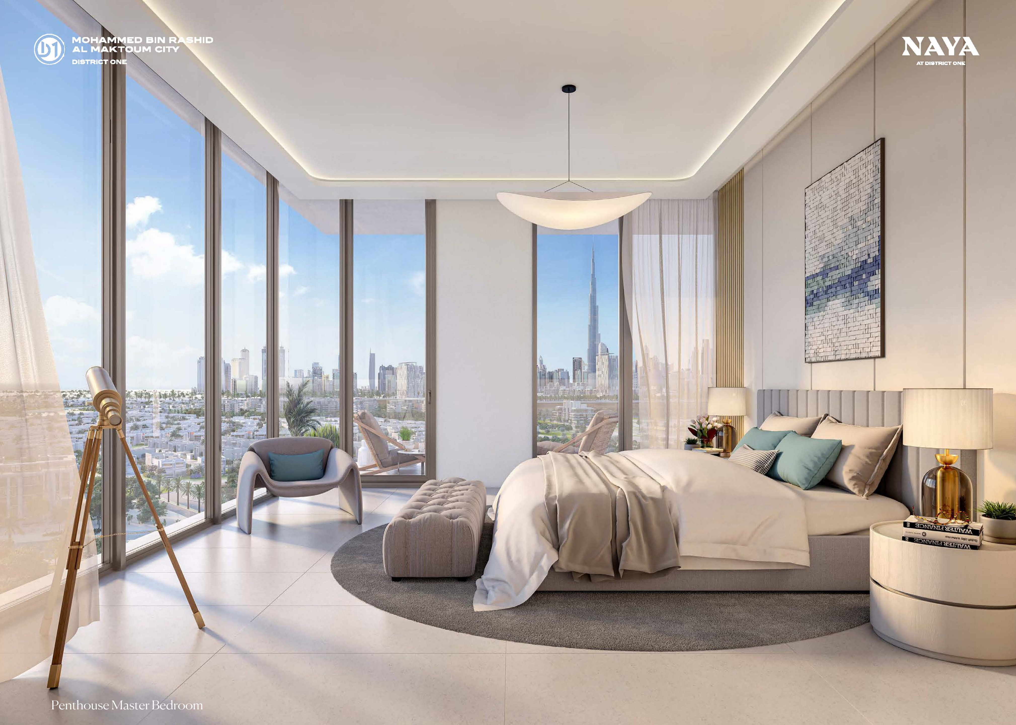
Penthouse Master Bedroom