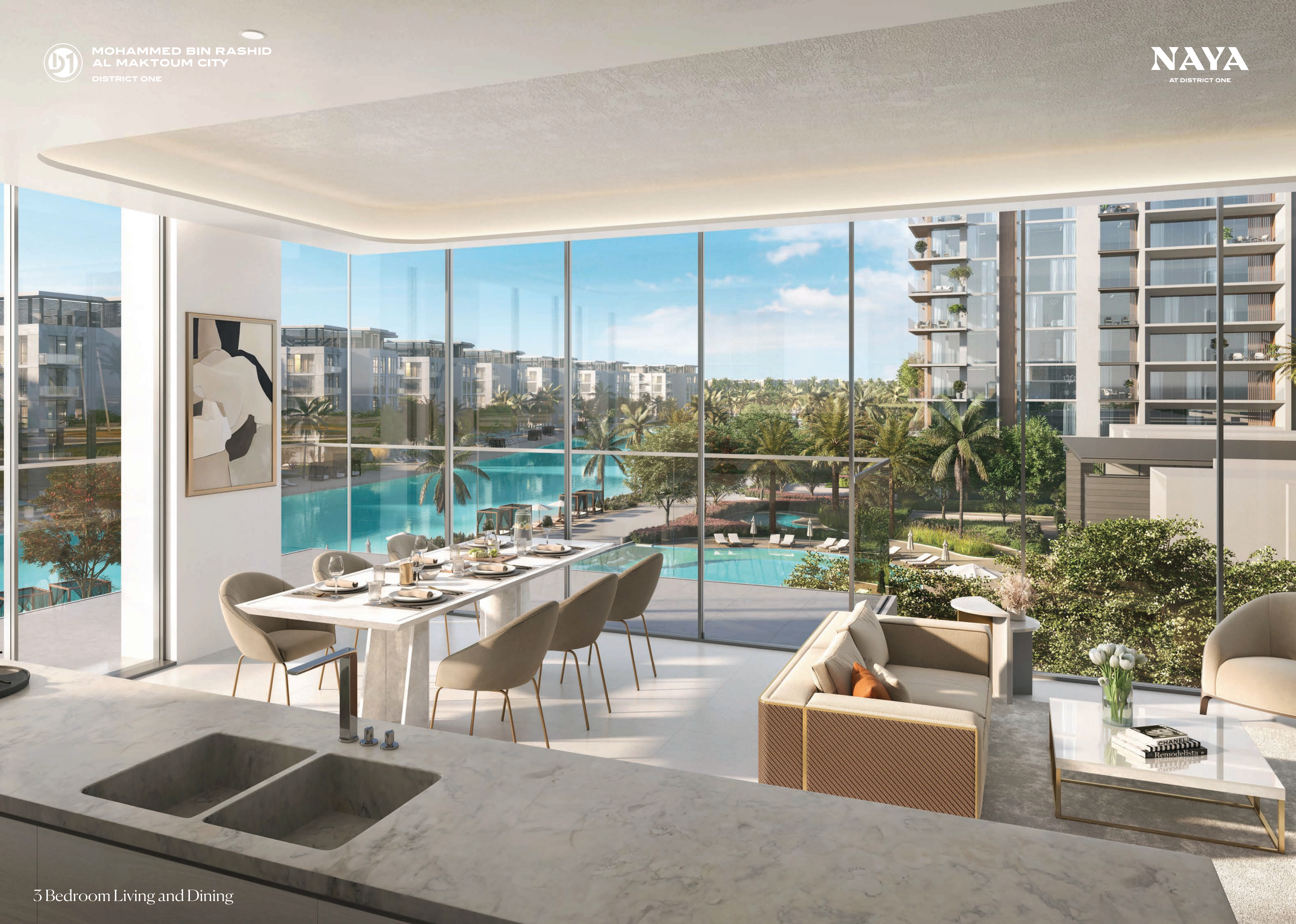
3 Bedroom Living and Dining